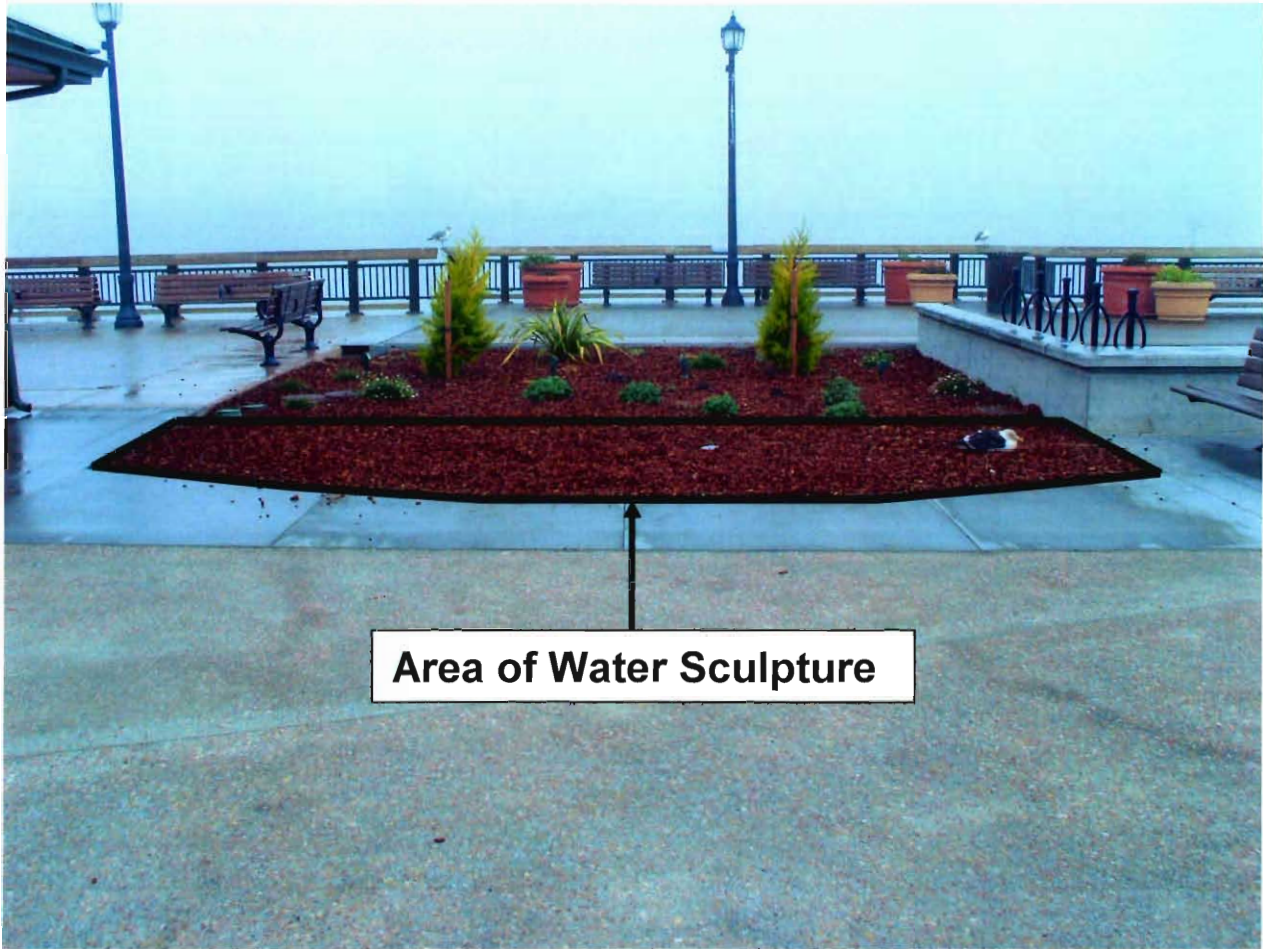
‘C’ Street Market Square looking northerly toward the Boardwalk from the Market Square. Planter wall and bikeracks are on the right, ticket booth is on the left.